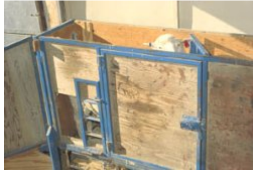
In a just-completed 2-year study, researchers put the hind legs of aging ewes—a model for osteoporosis in people—on this vibrating platform for a daily shake. The vibrated legs lost less bone than the animals' untreated forelegs. Depending on the frequency of the vibrations, some bones gained mass.

For EMFs to penetrate the body, the coils must carry a pulsing electric current, he explains—not the simpler direct currents associated with electrode-generated fields. In designing the waveform for these oscillating fields—their shape, amplitude, and frequency—"we were guided by measurements people were making of natural, mechanically induced voltages in bone," Pilla