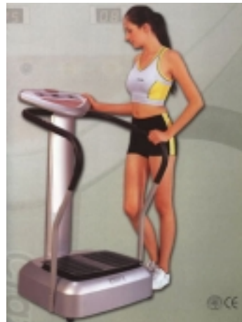
Women at risk for osteoporosis got a daily buzz on a vibration machine. www.myvibraslim.com

The experimental osteoporosis-fighting machine represents just one technology in a wave of new applications of electric and magnetic fields (EMFs) to bone injuries and related problems. All build on decades of work by physicists and surgeons. Though much of this work remains experimental, the Food and Drug Administration acknowledges that when properly applied, EMFs can make for good medicine.