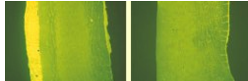
Yellow dye highlights new growth in these sections of wing bones from live turkeys. In contrast to the wing treated with coils triggering a very tiny current in bone (left), the one placed in inactive coils (right) shows no new tissue.